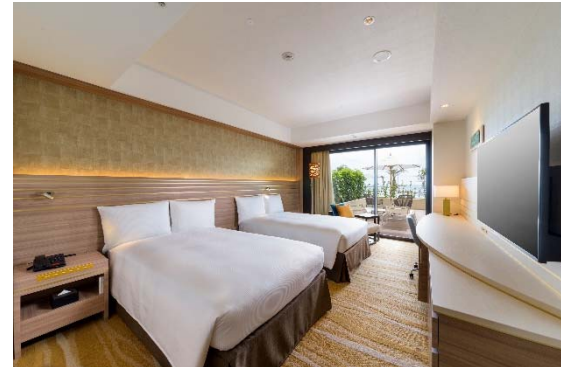
Guest room with an ocean view (terrace, twin beds)

The public spaces leading to guest rooms are designed with an ocean theme, with wallpaper, carpet, and other elements in a color scheme symbolizing sand, coral, and waves with sparkling accents. The spatial design creates an extraordinary resort atmosphere seamlessly incorporating the exquisite ocean views.