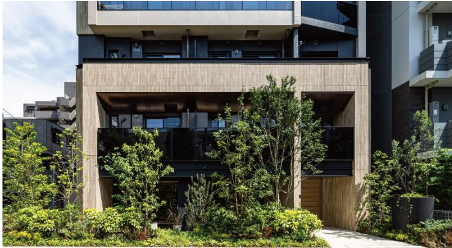
Main approach of The Lions Myles Kuramae

TOKYO, Japan – October 15, 2025 – DAIKYO INCORPORATED (“DAIKYO”) announced that its condominium, The Lions Myles Kuramae, has been awarded the GOOD DESIGN AWARD 2025 by the Japan Institute of Design Promotion.