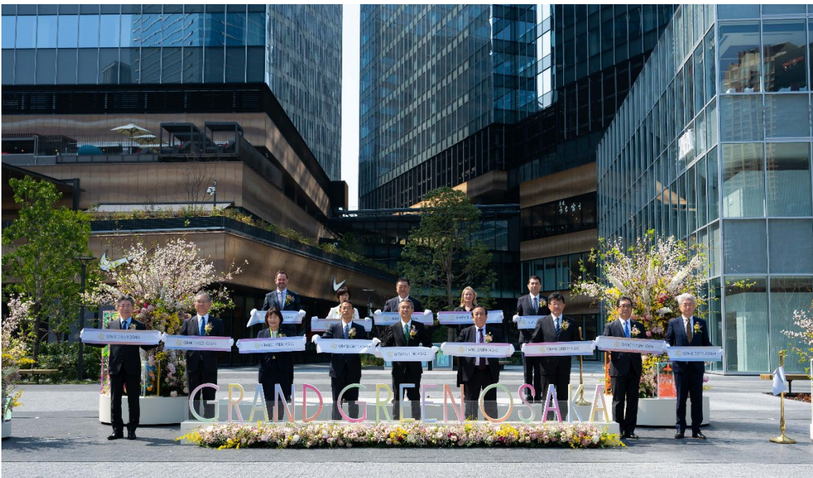
▲ GRAND GREEN OSAKA South Wing Opening Ceremony

Under the planning concept of “Creating ‘Osaka MIDORI LIFE’” and “Combining ‘MIDORI’ and ‘Innovation’”, JV9 will continue to offer valuable and engaging experiences by collaborating with visitors, MIDORI Partners *4 , and various facilities, sharing the unique appeal of GRAND GREEN OSAKA with the world.