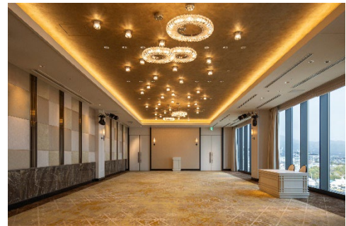
BANQUET HALL SUI

The 12th floor features a multipurpose hall suitable for weddings and banquets. Designed with large glass panels to maximize natural light, the hall offers a bright space where guests can enjoy special moments while overlooking the scenic beauty of Beppu.