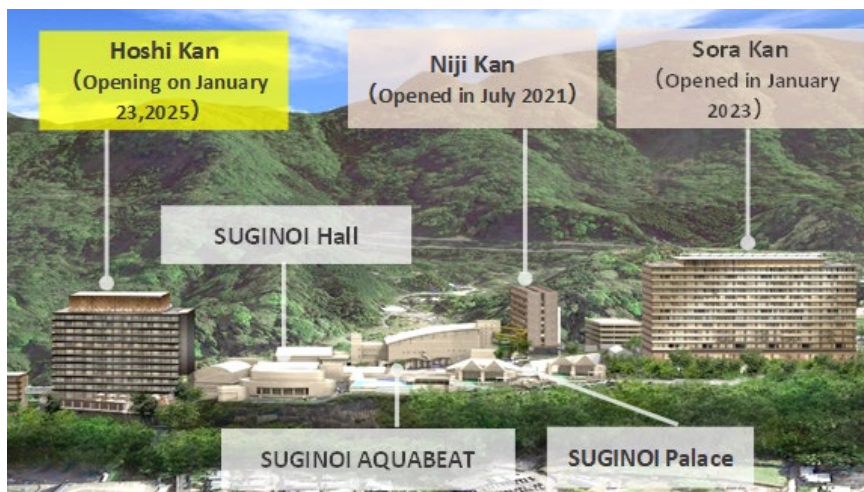
Overall concept image of Beppu SUGINOI HOTEL

Regarding shared facilities, the renovation of the multipurpose SUGINOI Hall (formerly Hikari Hall), which includes a grand banquet hall with a maximum capacity of 500 people, was completed in 2020. In December 2022, the popular entertainment facility, SUGINOI Bowl, was transformed into SUGINOI BOWL & PARK, featuring eight attractions, including bowling, digital shooting, billiards, and darts. Additionally, the fountain show at the open-air hot spring facility, AQUA GARDEN, and the projection mapping program on the walls of the indoor leisure pool, SUGINOI AQUABEAT, were updated. In July 2023, the hotel's iconic large panoramic open-air bath, Tanayu, underwent its first renovation in 20 years. To celebrate the opening of Hoshi Kan, the finale of the large-scale renovation, a new retail and game area called Hoshizora Komichi SHOP & GAME will open on the first floor of SUGINOI Palace.