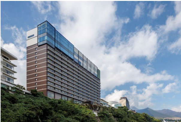
Exterior of the new guest room building, Hoshi Kan

TOKYO, Japan – January 21, 2025 – ORIX Real Estate Corporation (“ORIX Real Estate”) announced that the third new guest room building, “Hoshi Kan,” of the Beppu SUGINOI HOTEL will open on January 23, 2025, completing the hotel’s large-scale renovation. With the opening of Hoshi Kan, the large-scale renovation project that began in 2019 has been completed, and the revitalized SUGINOI HOTEL will officially celebrate its grand reopening.