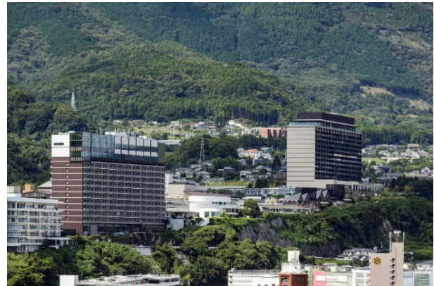
Panoramic view of Beppu SUGINOI HOTEL

This approximately five-year project involved the development of three guest room buildings, including new construction and rebuilding, as well as renovations to shared facilities and infrastructure improvements. In July 2021, the casual guest room building, Niji Kan (155 rooms), designed for active stays, opened, followed by the flagship luxury stay building, Sora Kan (336 rooms) in January 2023. With the opening of the final guest room building, Hoshi Kan (300 rooms), on Thursday, January 23, 2025, the large-scale renovation will be fully completed.