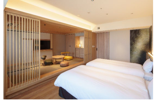
Deluxe Room, in Japanese-Western-style

Inspired by the facility's name, which seeks to evoke the excitement of stars twinkling in the night sky, the guest room color themes are based on three phases of the night sky: "YOWA" (deep night), "YOI" (dusk), and "AKATSUKI" (dawn), reflecting the transition from twilight to deep night and the light of stars before daybreak.