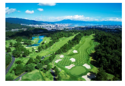
Seta Golf Course