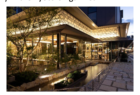
CROSS HOTEL KYOTO