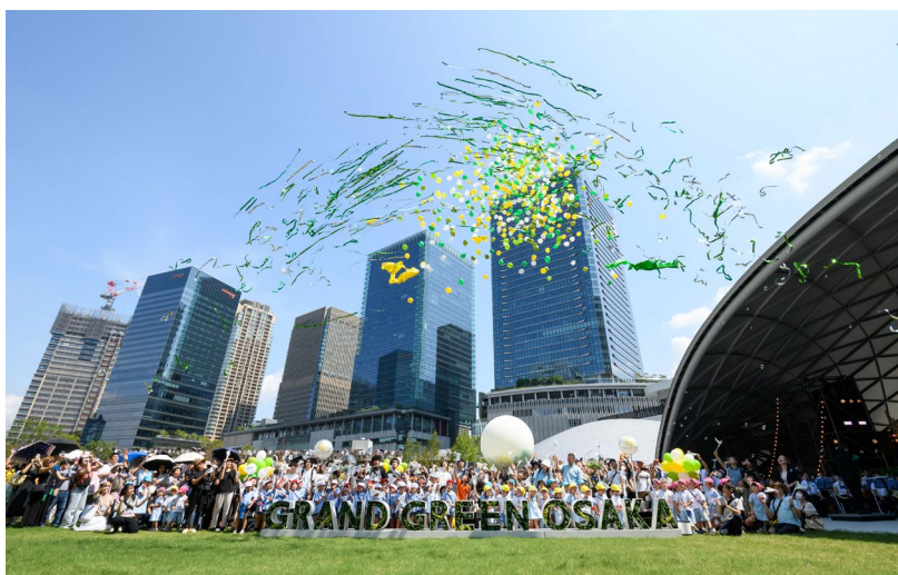
▲ Opening ceremony