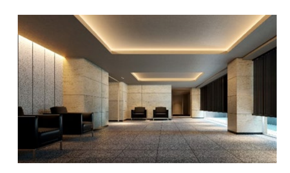
The Lounge (Air Grand)