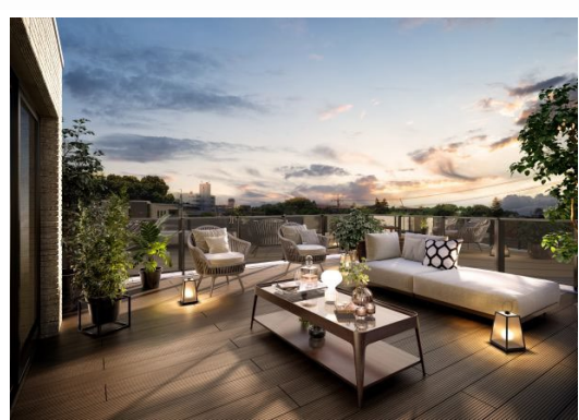
Penthouse roof balcony (image)