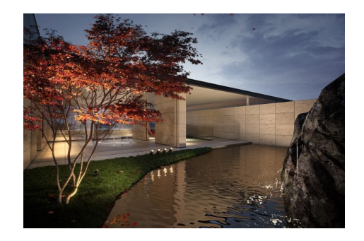
The Water Basin

There are two entrance lounges; The lounge at Gate Grand is a spacious area with a view of the water basin and waterfall flowing down the rock through the glass. The Air Grand lounge can be accessed directly from the parking lot and has a vertical lattice at the opening letting in delicate light and creating a calm space. In addition, for all 35 units, 35 parking lots of 2.7 m x 5.3 m that can accommodate large vehicles such as imported cars have been secured, and all lots are indoor flat parking lots that can accommodate EV charging. A shutter gate is installed at the entrance of the parking lot to increase privacy and crime prevention.