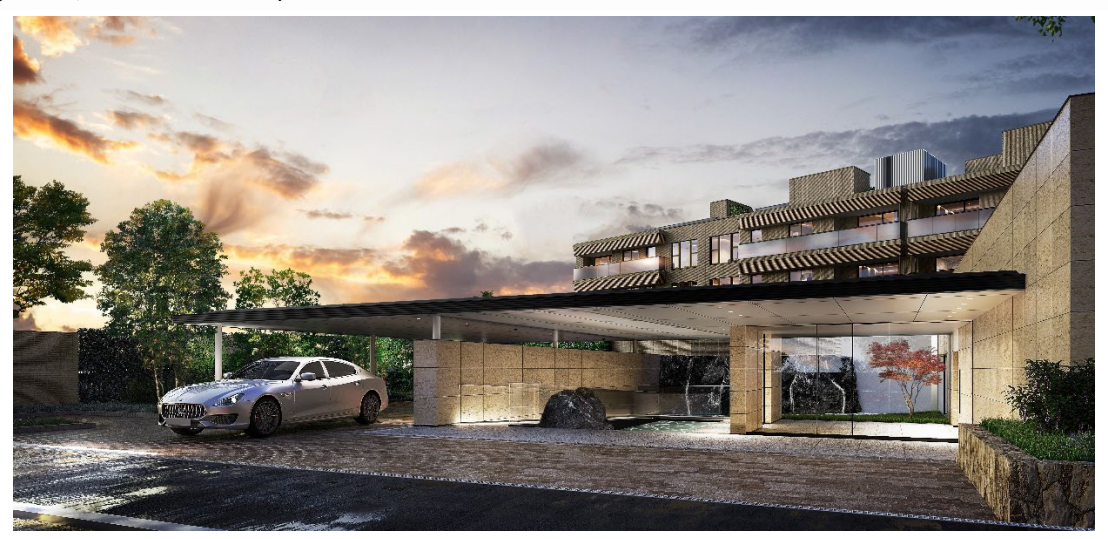
Conceptual image of the exterior of Lige Minamiyama

TOKYO, Japan – March 13, 2024 – DAIKYO INCORPORATED ("DAIKYO") announced that it has completed development of the condominium in Nagoya, Aichi, Lige Minamiyama (three floors above ground, one story below ground, 35 units in total).