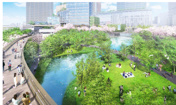
UMEKITA PARK North Park