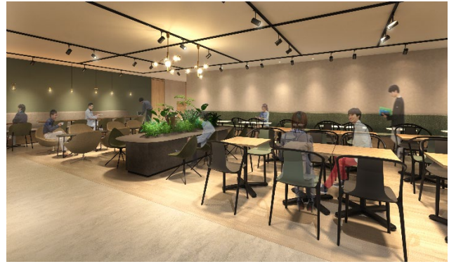
Rest Area of the South Building *Scheduled to Open in around Spring 2025