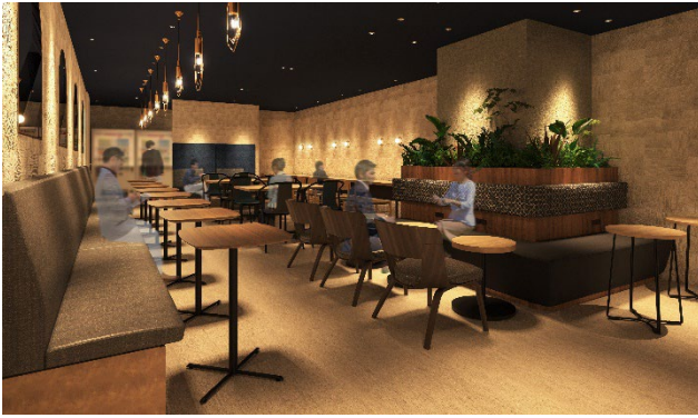
Rest Area of the North Building