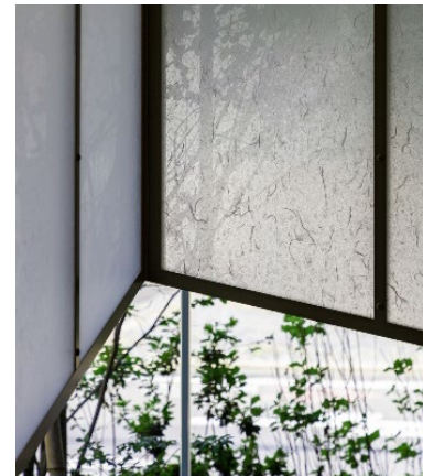
Japanese paper-like materials that create “transparency”