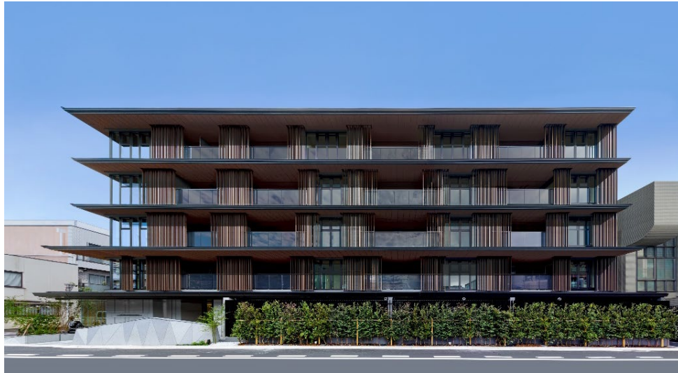
Lions Kyoto Goshō-Minami Residence

TOKYO, Japan - October 5, 2023 - DAIKYO INCORPORATED (“DAIKYO”) announced today that it won an award for its condominium Lions Kyoto Goshō-Minami Residence at the GOOD DESIGN AWARD 2023, presented by the Japan Institute of Design Promotion.