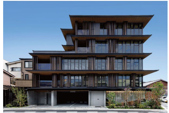
Exterior design avoiding the heavy feel of an RC structure

The placement of the columns and the shape of the eaves and beams is designed to avoid the heavy feel of reinforced concrete structures. Also, the horizontal lines of the eaves are emphasized to hide the beams, and vertical bars are placed to obscure the boundaries between columns, walls, and glass, thereby reducing the presence of the walls.