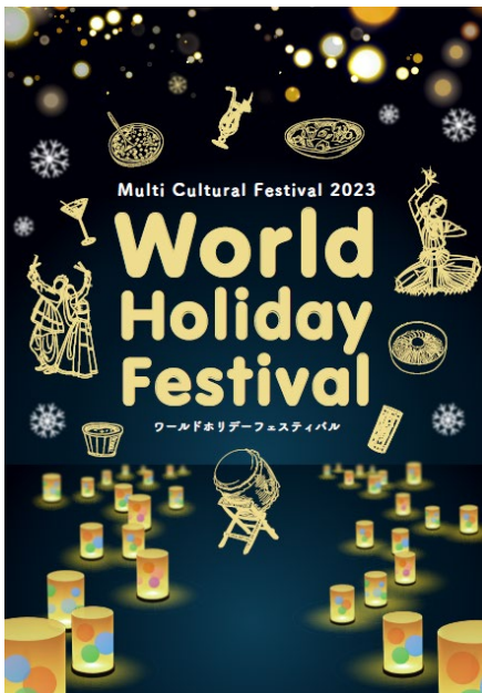
Multi Cultural Festival 2023 ~World Holiday Festival~ (illustrative image)

TOKYO, Japan - September 27, 2023 - ORIX Real Estate Corporation (“ORIX Real Estate”), Ritsumeikan Asia Pacific University (“APU”), and Suginoi Hotel And Resort Co., Ltd. announced today that they will host the hotel event “Multi Cultural Festival 2023 ~World Holiday Festival~” (“MCF2023”)—an event where students take the lead in planning and operation—at Beppu SUGINOI HOTEL for a limited period of two days from December 9 to 10, 2023.