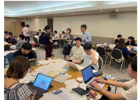
Conduct of practical learning*