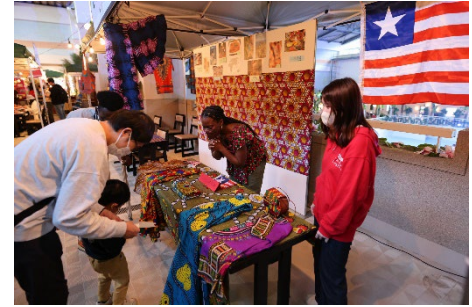
Booth at Multi Cultural Festival 2022 for experiencing ethnic clothes

* A special lecture of the industry-academia program for learning from professional human resources in a practical manner