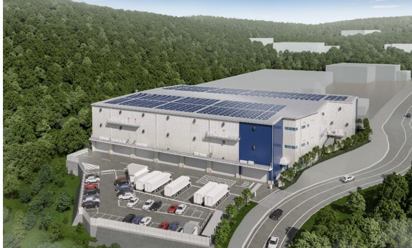
Exterior image of Kyotanabe Logistics Center

TOKYO, Japan - August 26, 2022 - ORIX Real Estate Corporation (“ORIX Real Estate”) announced that it began development of the Kyotanabe Logistics Center, a multi-tenant logistics facility in Kyotanabe, Kyoto.