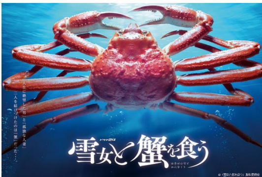
PR material for "Yukionna to Kani wo Kuu"

TOKYO, Japan - August 8, 2022 - ORIX Hotel Management Corporation ("ORIX Hotel Management") announced today that it hosted the filming of the drama series "Yukionna to Kani wo Kuu ('Eating Crab with Snow Woman') on TV TOKYO Drama 24 at three ORIX HOTELS & RESORTS facilities: Aizu Higashiyama ONYADO TOHO in Aizuwakamatsu, Fukushima; Hakodate Yunokawa HOTEL BANSO in Hakodate, Hokkaido; and CROSS HOTEL SAPPORO in Sapporo, Hokkaido. To commemorate the filming, ORIX Hotel Management developed tie-up accommodation plans in collaboration with the show and will begin accepting reservations on August 6, 2022.