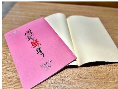
Image of the special script notebook for the tie-up plan

ORIX Hotel Management is promoting the Regional Co-creation Project* at a total of 15 of its managed onsen hotels and hotels (including those outsourced to third parties for operation). As part of this initiative, we are developing the "ORIX Location Service" to promote the use of our facilities as locations throughout the region and to our managed facilities. Since 2007, ORIX Hotel Management has been promoting the use of facilities operated by ORIX Group for filming, and since May 2021, it has been actively promoting the hosting of filming locations in collaboration with local governments while expanding the scope of its activities to include surrounding sightseeing spots.