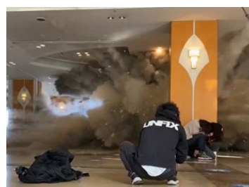
(Left) Cross Wave Fuchu, the investigation meeting room in "Bayside Shakedown the Final" (filmed in 2012)