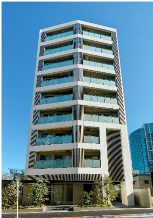
Lions Forsia Shirokane-takanawa, completed in September 2020

Lions Forsia is DAIKYO's rental condominium brand, and uses expertise cultivated by the company since it began developing condominiums in 2007. Thus far, DAIKYO has developed 21 Lions Forsia rental condominiums (including this property) in Tokyo, Kanagawa, Osaka, and Hiroshima. The majority of tenants are in their 20s, 30s, and 40s and work in city centers, and include singles, husbands and wives who both work, and families with small children. These carefully and uniquely designed condominium exteriors incorporate trends from hotels and commercial facilities, while offering a range of unit plans catering to the lifestyle needs of the tenants living in urban area.