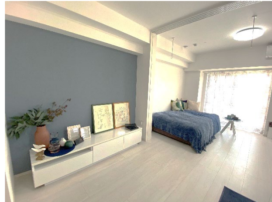
Room interior (model room)

Lions Forsia Asakusabashi is located five minutes' walk from Asakusabashi Station with access to the Toei Asakusa Line and JR Sobu Line and offers comfortable access to major areas in Tokyo. The surrounding area includes traditional restaurants and stores that evokes an old downtown atmosphere.