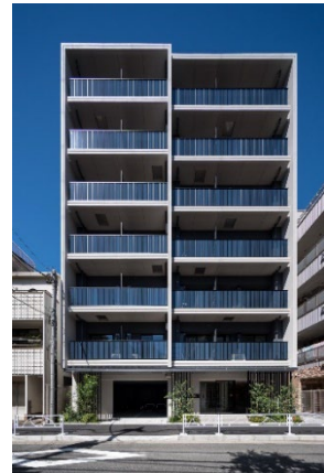
Lions Forsia Oshiage, completed in August 2021