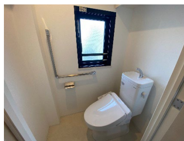
Handrails next to the toilet