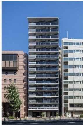
Lions Forsia Gotanda, completed in September 2021