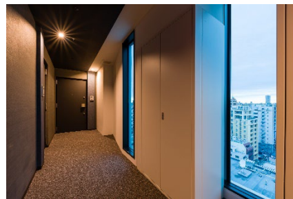
Indoor corridor design

Keys embedded with IC chips that can unlock the entrance by holding them to the receivers have been used. In addition, the corridor that connects each unit uses an indoor corridor design for security. Two vertical windows are installed on all floors to allow light into the building during the day and create a bright common area.