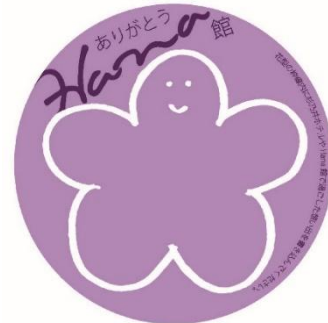
Stickers for Writing Messages (image)