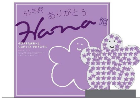
Message Art (image)