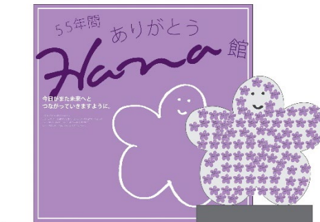
Message Art (image)