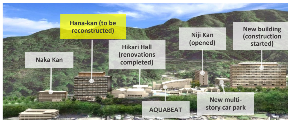
Concept image of the hotel after completion of the large-scale renovations

Along with the reconstruction of Hana-kan, a total of three guest room buildings will be newly constructed. Completion of all works is slated for 2025.