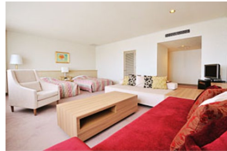
Deluxe Twin room (ocean side) of Hana-kan