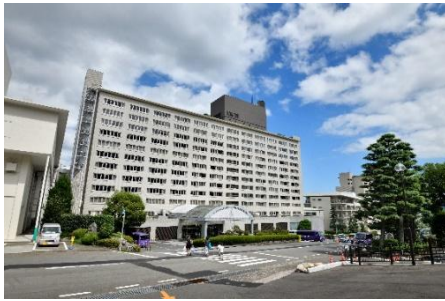
External façade of Hana-kan