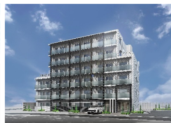
Belle Face Komazawa-daigaku

* As of September 2021; pictures are conceptual images and may differ from the actual properties.