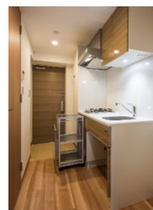
Mobile kitchen storage (Belle Face Monzen-nakacho II)