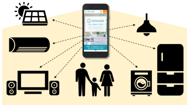
Concept of service

TOKYO, Japan - September 30, 2021 - ORIX Real Estate Corporation ("ORIX Real Estate") announced that it will be introducing a digital service that allows the central management of manuals and warranties—such as for household appliances and residential facilities—under its original Belle Face brand of rental condominiums. This service will be gradually introduced at all three properties—Belle Face Daitabashi (Suginami-ku, Tokyo; 38 units), Belle Face Kiba (Koto-ku, Tokyo; 57 units), and Belle Face Komazawa-daigaku (Setagaya-ku, Tokyo; 47 units)—that be completed from September 2021. It will also be adopted as standard for all properties being completed in the future.