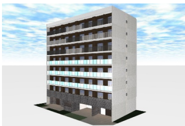
Belle Face Kiba