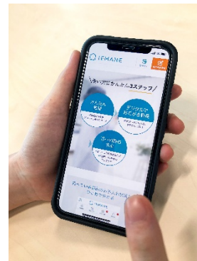
Example of operation

The service being introduced this time is IEMANE ® , which is provided by Toppan Inc., and this is the first time it is being adopted for tenants of rental condominiums. The product information of residential facilities found in units—such as built-in kitchens and bathrooms—is managed in the cloud, allowing it to be easily viewed from computers, tablet devices, and smartphones whether within or outside the unit. Products, including household appliances, bought by tenants themselves can also be added and registered. As warranty periods can be registered together with warranties, this service helps in the central management of warranty periods in addition to being paperless. IEMANE ® will be provided free of charge to Belle Face tenants.