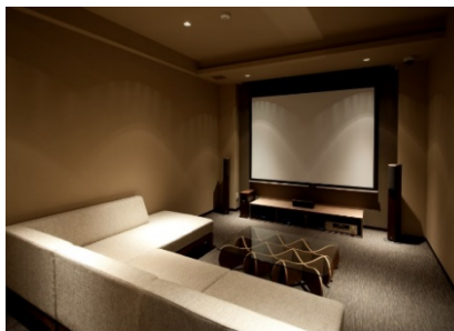
Theater room (Belle Face Meguro)