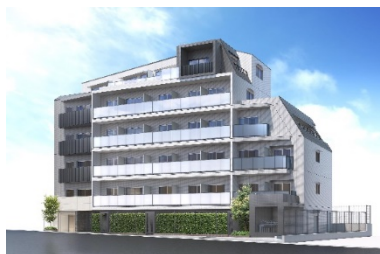
Belle Face Daitabashi