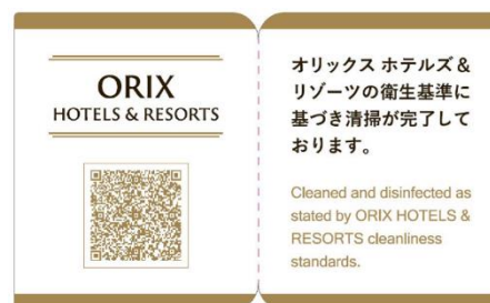
“Clean Stay” room sticker (image)

“Clean Stay” room stickers are signs guaranteeing that, in addition to cleaning and disinfecting guest rooms based on the guidelines, areas that are frequently touched by guests have been wiped down carefully with special cleaning agents and the like. They are placed on doors after guest rooms have been cleaned to guarantee the room’s state of hygiene management.