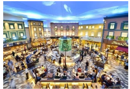
World Dining Ceeda Palace

World Dining Ceeda Palace is gorgeously decorated in the Napolitan style, and features a large aquarium at its center. In addition to its Western, Chinese, and Italian buffets, the restaurant is also popular for its à la carte Oita specialties, such as Seki horse mackerel and Bungo beef steak.