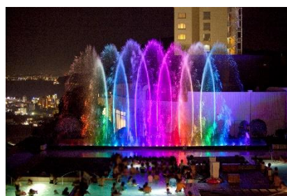
The Aqua Garden Fountain Show

The Aqua Garden is an open-air swimwear hot spring. Covering a massive 3,200 m 2 , the facility provides a range of hot spring-based entertainment that can be enjoyed by families and couples alike: illuminated, musical water fountain shows; Fango Therapy, a form of treatment in which guests pack their entire bodies with hot spring clay; and the Float Heating Bath, in which guests float in hot water with high concentrations of salt.