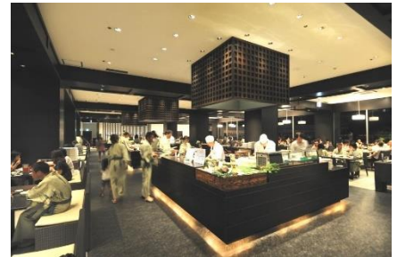
Buffet Restaurant Seeds

Guests staying at Niji Kan will usually dine at World Dining Ceeda Palace.