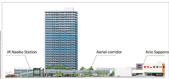
Aerial walkway (concept image)

Part of the city's drive to promote urban redevelopment in Sapporo, a distance of approximately 200 m from the north exit of Naebo Station to the first floor of the commercial facility Ario Sapporo is being linked by an all-weather, fully-enclosed aerial walkway. The walkway also directly links to the public passage joining the north and south exits of Naebo Station, allowing convenient access protected from rain or snow. The second floor of Ario Sapporo will also to be linked to the walkway, although the timing of this development has not yet been determined.