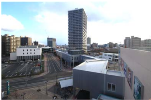
Aerial walkway as seen from Ario Sapporo

TOKYO, Japan - February 25, 2021 - DAIKYO INCORPORATED, Sumitomo Realty & Development Co., Ltd., and Hokkaido Railway Company announced that an all-weather aerial walkway — developed as part of Sapporo City's project to develop advanced buildings in the western district of JR Naebo Station's north exit — will open for use from March 4, 2021.