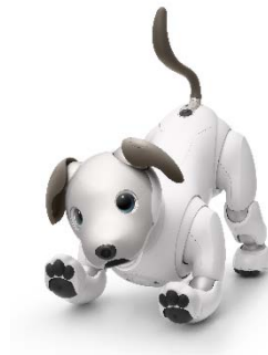
Sony's aibo entertainment robot

The aibo entertainment robot was designed to elicit empathy from humans, and so inspire affection and the joys of nurturing. aibo incorporates various sensing technologies refined by Sony over many years. External data gathered using an array of cameras, microphones, and other sensors embedded in every part of aibo's body is stored in the cloud, where it is processed using artificial intelligence. Aibo is therefore able to develop intelligently and individually.