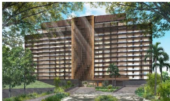
Concept image of completed building

TOKYO, Japan - November 12, 2020 - ORIX Real Estate Corporation (“ORIX Real Estate”) announced that it will start construction of a second new guest room building (“the new building”) at Beppu SUGINOI HOTEL, a hotel operated by ORIX Real Estate, as part of the large-scale renovation project *1 slated for overall completion in 2025.