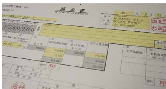
Image of paper invoice

KAGAWA, Japan - September 30, 2020 - Anabuki Construction Inc. ("Anabuki Construction") announced that it is using an invoice digitization system. The system is intended to streamline work processes involved in the receipt of invoices, and thereby promote teleworking.