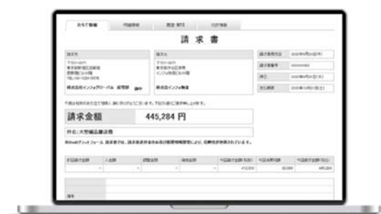
Actual operation screen of digital invoice

In addition to its Head Office and 13 branch offices, Anabuki Construction also carries out business at numerous construction sites, showrooms, and other locations. At a total of 80 or so work sites, the company currently receives approximately 2,000 invoices per month. Introduced in June 2020, the new system enables Anabuki Construction to receive, automatically itemize, and internally approve digital invoices that have been created and issued by its customers; it has resulted in a significant reduction in invoice-related workloads. Going forward, the company also plans to expand the scope of its digitization to contract documents.