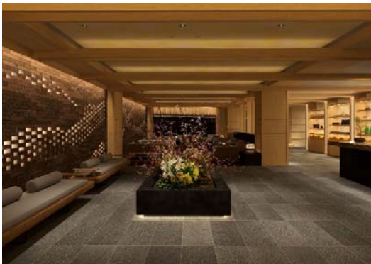
Lobby and lounge

TOKYO, Japan - July 1, 2020 - ORIX Real Estate Corporation (“ORIX Real Estate”) announced that Hakone Gora KARAKU, the onsen hotel it is developing in Gora, Hakone-machi, will open on October 2, 2020. Reservations will be accepted on the official website starting today: https://www.gora-karaku.jp/