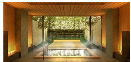
Hinoki-no-yu private rental bath

Three private rental baths are situated on the third floor of the Annex, each with its own decorative theme: Iwa-no-yu (“rock bath”), Hinoki-no-yu (“Japanese cypress bath”), and Shiruku-no-yu (“silk bath”). Here, guests can enjoy aesthetic charms distinct from the public baths of the Main Building in their own, private space. Reservations are required, and rental fees apply.