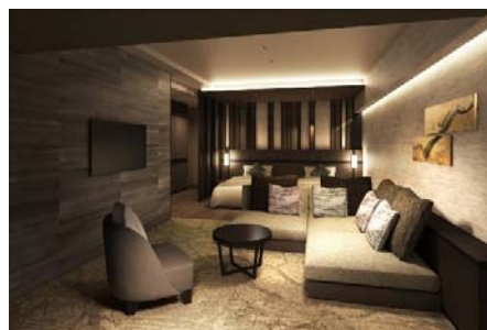
Western-style guest room, East Wing (57.8 m 2 including balcony)