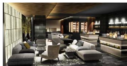
Guest lounge AWAI

Guest lounge AWAI is intended to be the heart of the onsen hotel complex and, as such, it is located above the walkways used to access the guest room wings. Guests can enjoy after-dinner drinks or post-breakfast coffees at the lounge, or relax there at their leisure during the day, or after bathing. The hotel complex also features two on-site terraces—the Water Terrace and the Forest Terrace—where guests can unwind surrounded by nature.