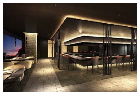
Teppanyaki restaurant Tomura