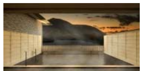
Myojo open-air bath with splendid view