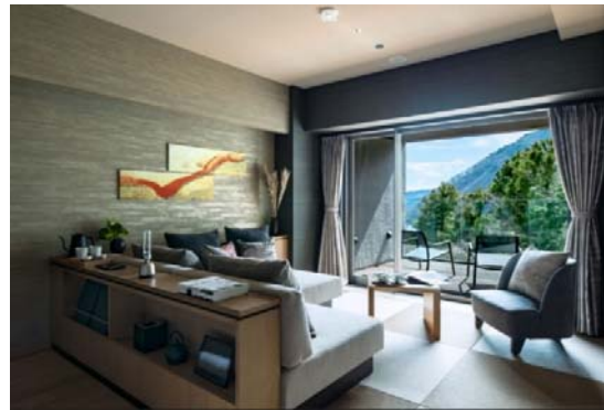
Japanese style guest room, East Wing

Hakone Gora KARAKU is the second onsen hotel to be newly constructed by ORIX Real Estate. Hotel staff understand that all guests have their own views of what constitutes an “appropriate distance” during their stay; for this reason, when reservations are made, staff ask guests how they wish to spend their time at the hotel, and what culinary preferences they might have. In this way, the hotel seeks to tailor the hospitality it offers to suit each individual guest.