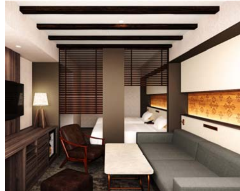
DX Twin/Convertible (Art Room) (conceptual image)

As part of these renovations, the walls, floors, and other surfaces of the 136 guest rooms on “Standard Floors” 4 to 13 will be redecorated, while their beds, other furnishings and facilities will be refurbished or replaced. Through more refined designs, the renovations will aim to create spaces in which guests will be able to feel the atmosphere of today’s Sapporo, its history, and its culture. All construction is scheduled to be completed by the end of April 2021; together with the special floors “CROSS Floors” 14 to 17—which have already been renovated—all 181 CROSS HOTEL SAPPORO guest rooms will be reborn. The guest rooms will be available for use as and when they are completed.