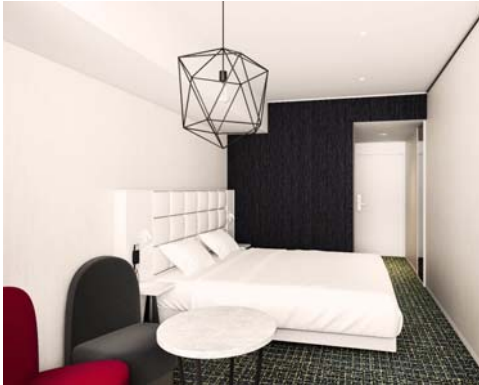
Double/HIP (Art Room) (conceptual image)

TOKYO, Japan – February 26, 2020 – ORIX Real Estate Corporation (“ORIX Real Estate”) announced that it will carry out large-scale renovations of guest rooms at its CROSS HOTEL SAPPORO.