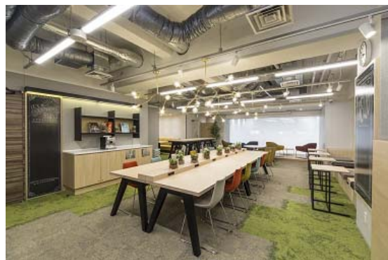
Cross Office Shinjuku

ORIX operates six Cross Office bases at present, and this plan will cover the four that feature coworking spaces, lounges, and other shared facilities: Uchisaiwaicho, Mita, Shinjuku, and Roppongi. Under the plan, customers who sign up to the Master Membership Plan will register a primary base and be entitled to use it 24 hours a day, 365 days per year; they will be entitled to use other bases covered by the plan on weekdays, from 9 am to 5 pm. The membership fee is fixed at 30,000 yen per month, excluding consumption tax. Cross Office Hibiya, which is scheduled to open in March 2020, will also be covered by the plan.