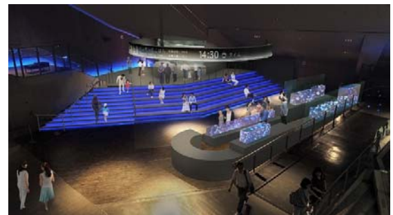
Panoramic view of the new open space

More than 30 tanks of various sizes will be lined up along a counter established beneath the stage, showing the different growth stages in the life of a jellyfish. Visitors will also be able to watch and converse with aquarium keepers as they engage in breeding work and research.