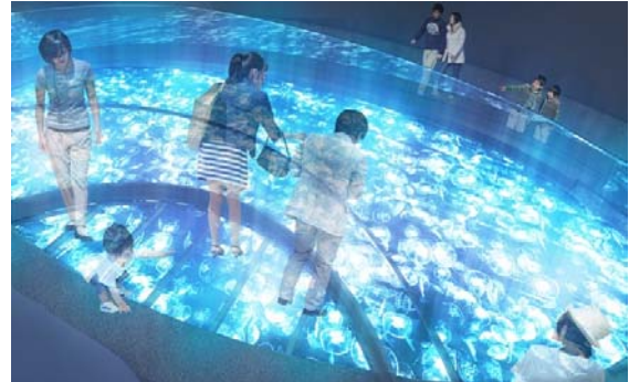
A glass-floor deck extends over the open-top tank

Following the renovations, SUMIDA AQUARIUM will have 700 jellyfish from 14 different species on display—including Rhizostomous jellyfish, which will be exhibited at the aquarium for the first time.