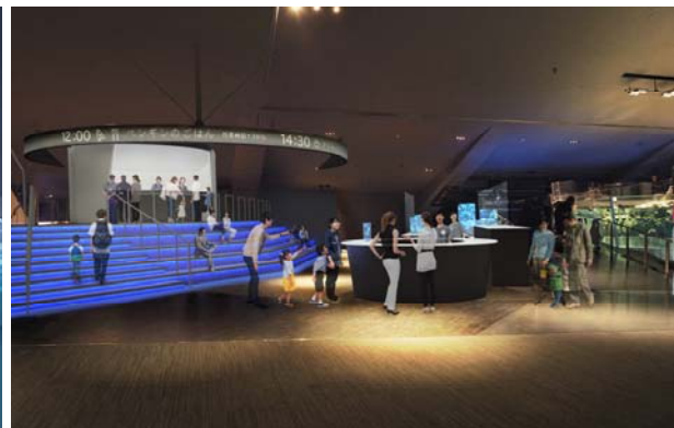
The new, open aquarium keeper area *Currently "Sumida Stage"

As part of these renovations, Aqua Lab, where visitors can observe aquarium keepers at work with jellyfish, Aqua Gallery, where tanks are lined up like a series of paintings, and the Sumida Stage multi-purpose space will be fully refurbished. They will be redesigned as two new areas where visitors will be able to observe the aquatic life and the aquarium keepers at work at even closer quarters.