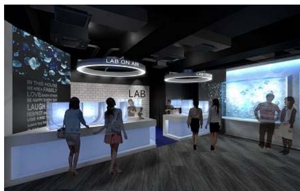
Tank exhibits where visitors can observe the breeding process of jellyfish (conceptual image)

The existing Jellyfish, Fish of Coral Reef, and Crustacean areas will be completely renovated. The new exhibition area will be installed with a dome tank 6.5 meters in diameter. Stepping into the area, visitors will be surrounded 360 degrees by a space where jellyfish swim elegantly in the tank, allowing them to enjoy as if they are floating in the sea together with jellyfish. In addition, work such as jellyfish breeding and research that has so far been conducted in the backyard will be carried out in open spaces, allowing visitors to learn in further detail ecology and other aspects while talking to aquarium keepers.