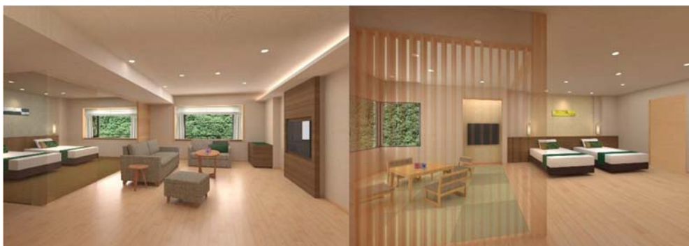
Western style room