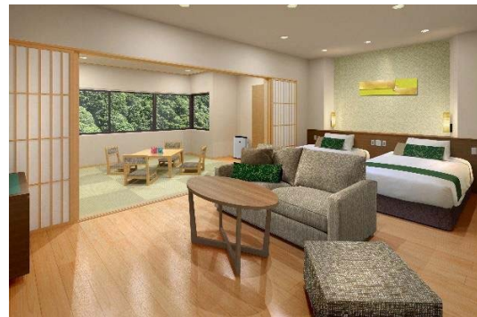
Asuka Deluxe Japanese/Western style room (Annex)

In September 2018, the Unazuki Suginoi Hotel rebranded as Unazuki Yamanoha. Renovation works—including earthquake proofing for the Main Building, increasing the number of guest rooms, and establishing new private baths and a relaxation room—have now been completed and, when it reopens, the onsen hotel will enable guests to relax with even greater peace of mind.