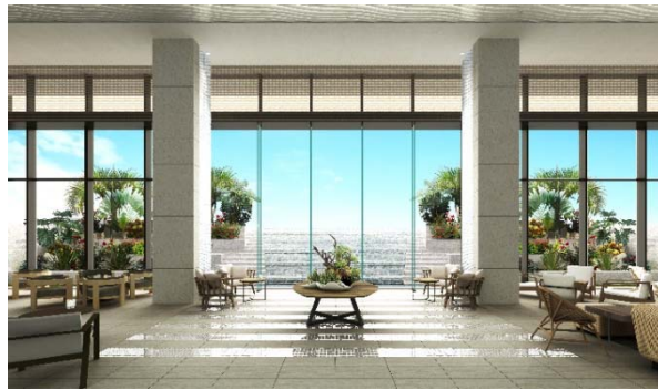
Entrance (Artist conception)