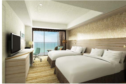
Standard room (Artist conception)

DoubleTree by Hilton Okinawa Chatan Resort is opening in an attractive location facing the beautiful ocean along the West Coast of Okinawa. Within walking distance of Mihama American Village, one of Okinawa's major commercial areas, the hotel grants convenient access to shopping, dining and entertainment; and just next door is the Hilton Okinawa Chatan Resort, which was opened by ORIX Real Estate in July 2014. Hotel guests are free to use the resort's outdoor and indoor pools, spa, and banquet facilities. The structure's white and Ryukyu limestone color scheme harmonize with the townscape, and the jade green accent evokes the color of Chatan's ocean. The signature design of DoubleTree by Hilton's five-story building and 160 rooms create an extraordinary atmosphere during your stay.