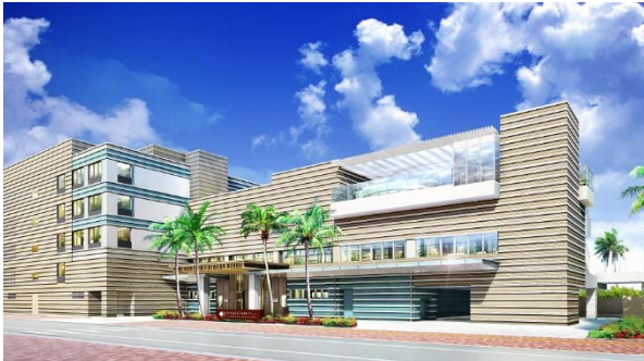
Appearance (Artist conception)

ORIX Real Estate is outsourcing management to Hilton (Headquarters: McLean, Virginia, U.S.A.; President & CEO: Christopher J. Nassetta).