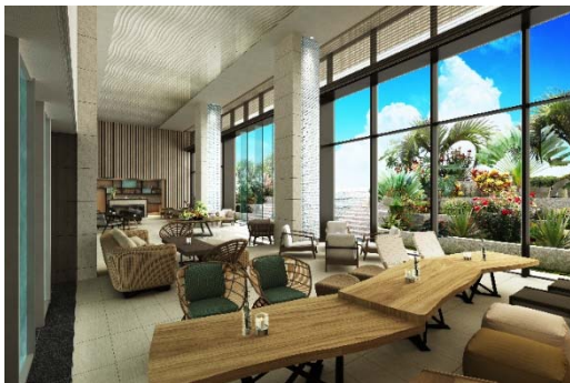
Lounge (Artist conception)

The hotel welcomes guests with an open lounge featuring a 5.6-meter high ceiling, a buffet-style restaurant, swimming pools for adults and children, a take-out café, and a rooftop bar with a panoramic view of the ocean.