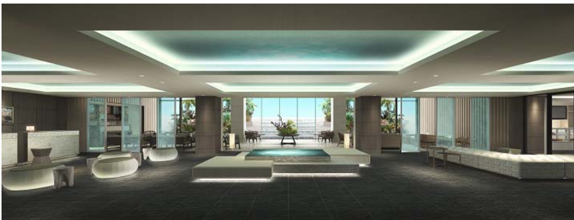
Lobby (Artist conception)

DoubleTree by Hilton Okinawa Chatan Resort is opening in an attractive location facing the beautiful ocean along the West Coast of Okinawa. Within walking distance of Mihama American Village, one of Okinawa's major commercial areas, the hotel grants convenient access to shopping, dining and entertainment; and just next door is the Hilton Okinawa Chatan Resort, which was opened by ORIX Real Estate in July 2014. Hotel guests are free to use the resort's outdoor and indoor pools, spa, and banquet facilities. The structure's white and Ryukyu limestone color scheme harmonize with the townscape, and the jade green accent evokes the color of Chatan's ocean. The signature design of DoubleTree by Hilton's five-story building and 160 rooms create an extraordinary atmosphere during your stay.