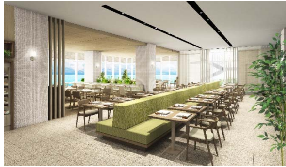
Restaurant (Artist conception)