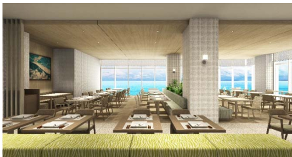
Restaurant (Artist conception)