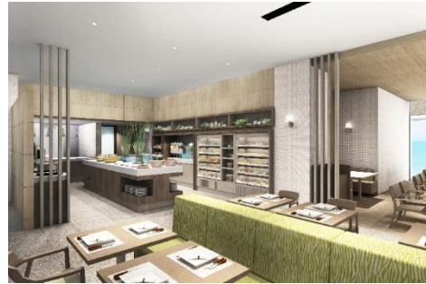
Restaurant (Artist conception)