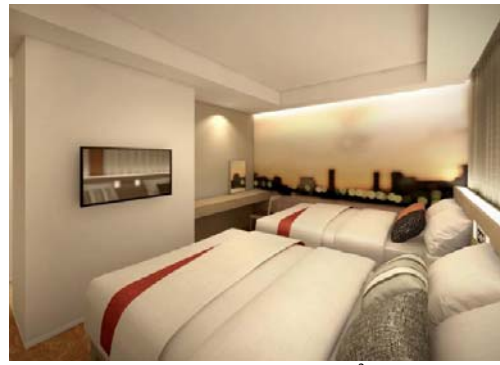
A deluxe twin room (approx. 27 m 2 ) with room under the bed to store suitcases

*The pictures and CG in this press release are impressions, and may differ from the actual finished products.