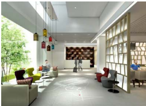
Inlaid tiles are used on the lobby floor to create a motif of Haneda Airport as seen from the sky

The number of passengers to Haneda Airport is expected to grow due to factors such as increasing inbound foreign tourists and the airport’s ease of access to or from central Tokyo. Going forward, ORIX Real Estate and Okura Nikko Hotel Management will continue to respond to increasing accommodation demands through its hotel businesses.