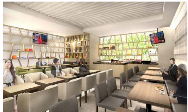
The walls in the lounge are patterned after the small alleys of the Edo period