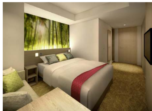
A standard double room (approx. 18 m 2 ) with a sofa for comfort