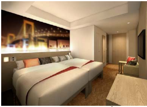
A Hollywood twin room (approx. 20 m 2 ) with room under the bed to store suitcases