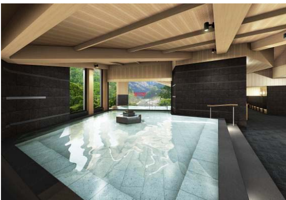
Tanayu, outside bath (perspective photographic image)