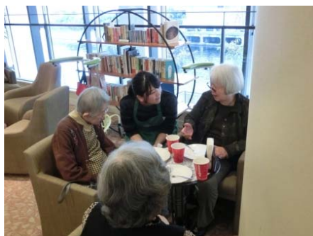
Internships (activity assistance)