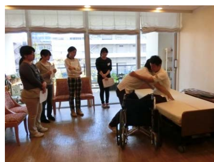
Internships (nursing experience)