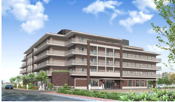
Exterior view: The land and building are leased