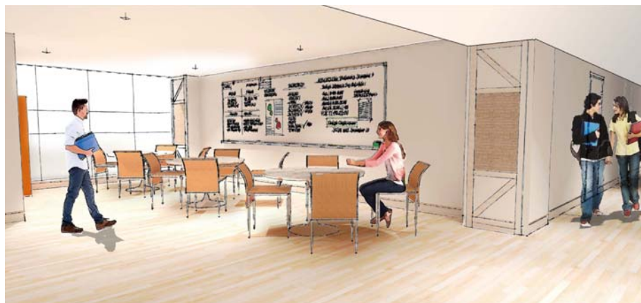
Community Lounge (artist's image)