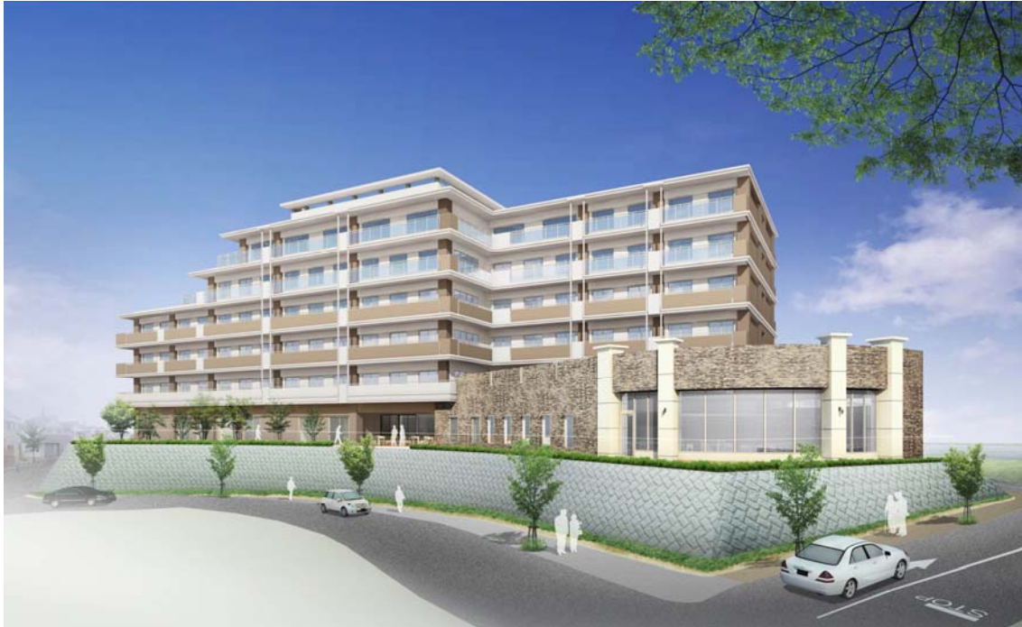
Land and building: Leased