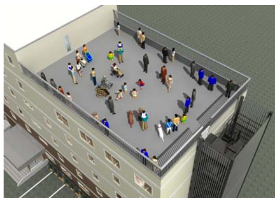
Rooftop refuge space