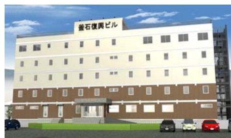
Artist's impression of exterior

Facilities: 70 rooms (Limit: 70 people) Childcare facility (5 th floor) Emergency storehouse (6 th floor) Rooftop refuge space (270 m 2 )