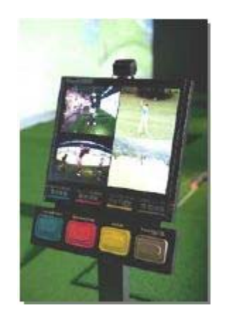
Spacious driving area zone