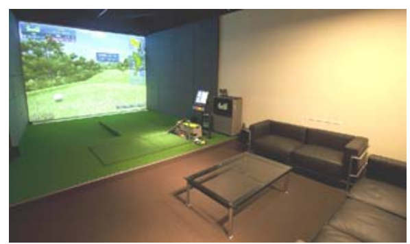
Multipurpose studio and adjacent driving area zone