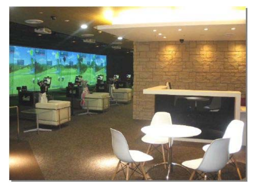
A splendid and well-furnished entrance area

The catchphrase for OGMGA Akasaka is "An Ingenious and Interconnected Hub in Golfing Begins Here." Under this slogan, the school aims to become a new site for social interaction and source for a wide variety of information centered on golf. In addition to the planning and hosting of bus tours and other golf events, OGMGA Akasaka will offer members opportunities to sample the latest trends in not only golf fashions but in cosmetics as well. In these and other ways, OGMGA Akasaka aims to propose new ways of enjoying golf, customized to match the lifestyle of each of its members.