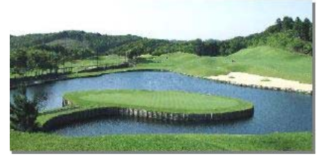
Photos of the virtual (left) and actual (right) 17<sup>th</sup> hole at Kimisarazu GOLF LINKS