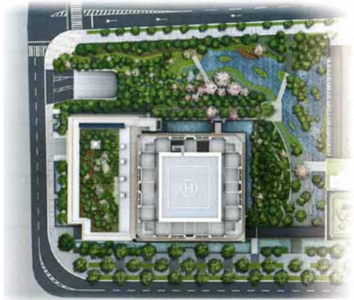
Site and surroundings

Landscaping of the grounds will be designed to offer a high degree of privacy, with emphasis on "easy access." This accessibility will be achieved by designing streets and walkways, layouts and lines of movement based on the principle of co-existence with nature, in addition to enhancing safety and security features as a matter of course. Despite its urban location, GRAND FRONT OSAKA OWNER'S TOWER will allow residents to lead relaxed lives surrounded by an abundance of water and seasonal flowering trees.