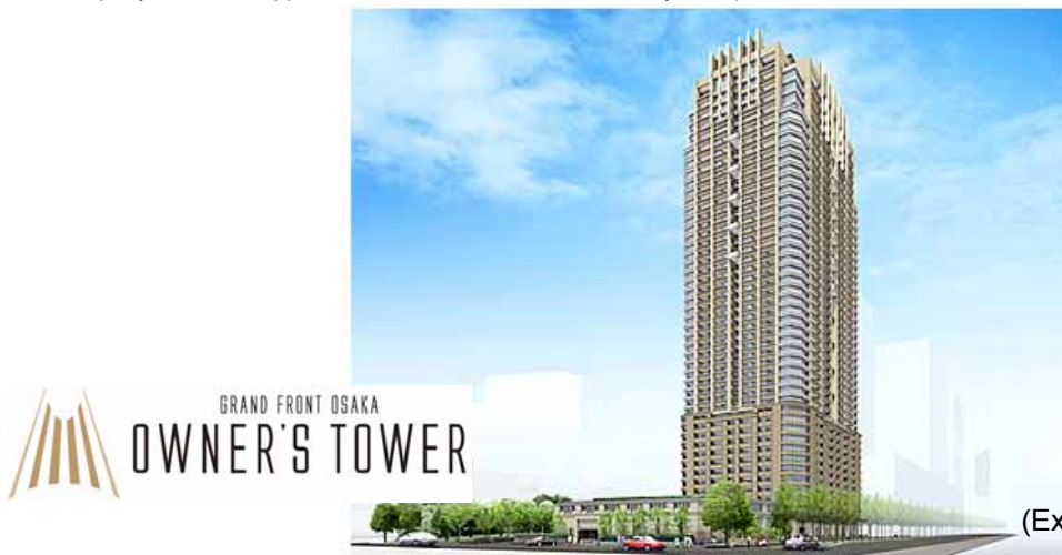
(Exterior perspective drawing)

*The 12 developers include NTT Urban Development Corporation, Obayashi Corporation, ORIX Real Estate Corporation, KANDEN FUDOSAN CO., LTD., Nippon Steel City Produce, Inc., Sekisui House, Ltd., Takenaka Corporation, Tokyo Tatemono Co., Ltd., Tozai Real Estate Company, Limited, Nippon Tochi-Tatemono Co., Ltd., Hankyu Corporation, and MITSUBISHI JISHO RESIDENCE CO., LTD.