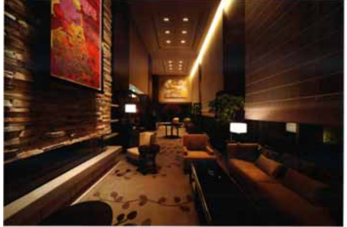
Experience "The Reception" guest lobby (left) and "The Living" lounge area (right) at the Reception House