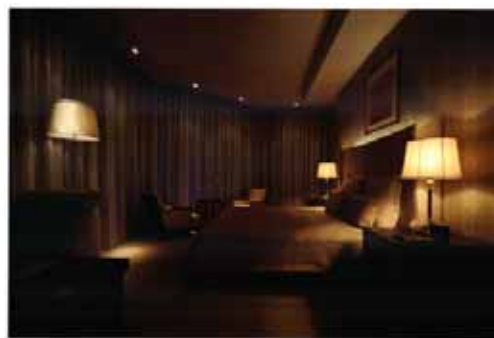
Images of the interior