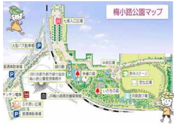
Map of Umekoji Park