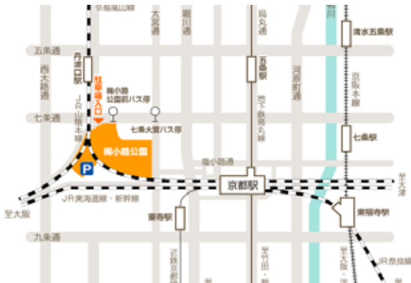
Location of Umekoji Park highlighted in orange