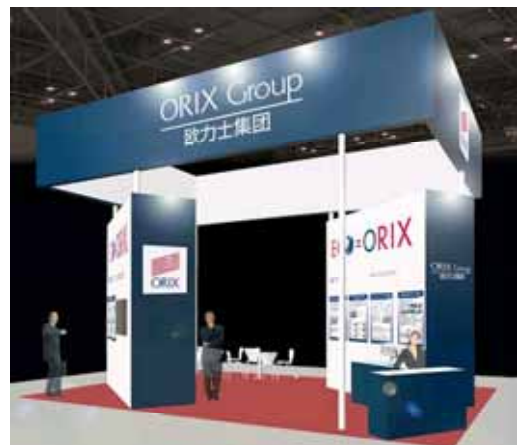
Artistic rendition of the ORIX Booth

ORIX established the first leasing company in China in 1981. After establishing the first rental company for precision measuring and other equipment in 2004, ORIX has been providing financial services capitalizing on the experience and know-how accumulated in Japan and overseas. In December 2009 ORIX established its Chinese headquarters ORIX (China) Investment Co., Ltd. in Dalian. ORIX entered into a strategic alliance with the Chinese Academy of Science in April 2010, and is considering the commercialization of joint projects in the areas of the environment and energy.