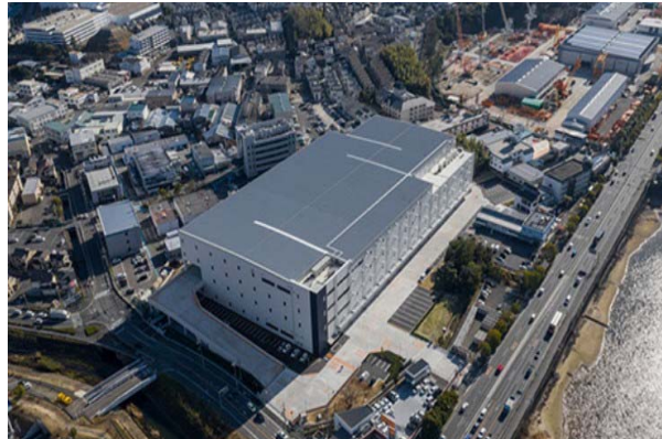
Exterior view of Hirakata II Logistics Center

TOKYO, Japan - February 27, 2020 - ORIX Real Estate Corporation (“ORIX Real Estate”) announced that it has completed construction of Hirakata II Logistics Center, a logistics facility located in Hirakata City, Osaka Prefecture.