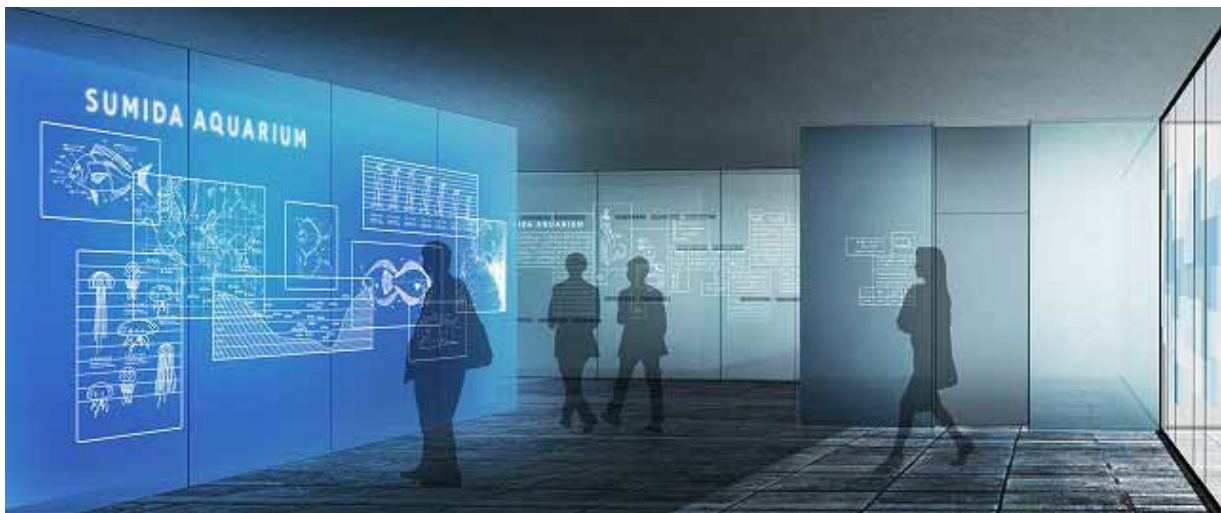
Image of entrance lobby

Facility name: SUMIDA AQUARIUM Planned opening date: May 22, 2012 Address: 1-1-2, Oshiage, Sumida Ward, Tokyo Access: Tokyo Sky Tree Station (currently Narihira-bashi Station) on the Tobu Isezaki Line Oshiage Station on the Tobu Isezaki Line, Keisei Oshiage Line, Toei Asakusa Line, Tokyo Metro Hanzomon Line Location: 5-6th floors, West Zone of TOKYO SKY TREE TOWN® Total floor space: 7,140 m 2 Total water volume: Approx. 700 tons Facility design: Taisei Corporation Facility construction: Consortium of Taisei Corporation and Tobu Yachida Construction